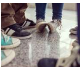
Shoes & Bags for all Seasons