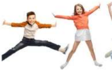
Childrens Clothing from New born Upwards