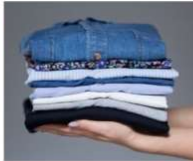
Adult Clothing & Bras