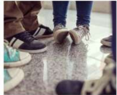
Shoes & Bags for all Seasons