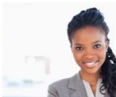
Smart Work Attire