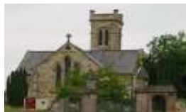
St. Luke's Clifford

2nd & 4th TUES 7.30pm Bell Ringing at All Saints' Bramham